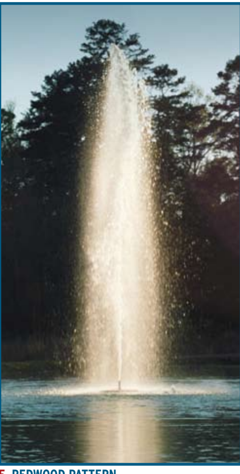
E REDWOOD PATTERN