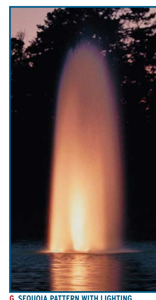
G SEQUOIA PATTERN WITH LIGHTING