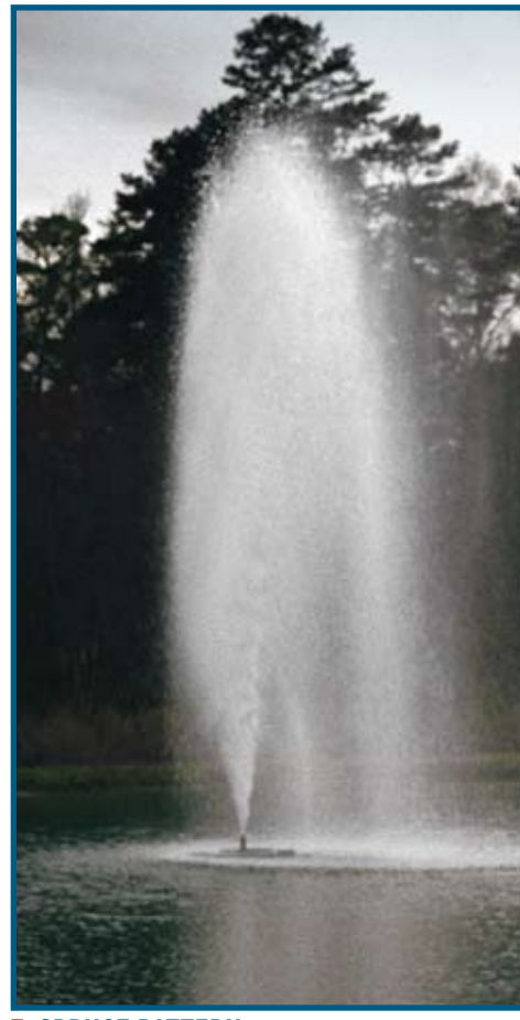
F SPRUCE PATTERN