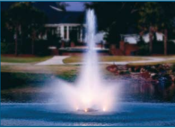
A LINDEN PATTERN WITH LIGHTING

All products are designed to ship by UPS at the best rate and delivery schedule