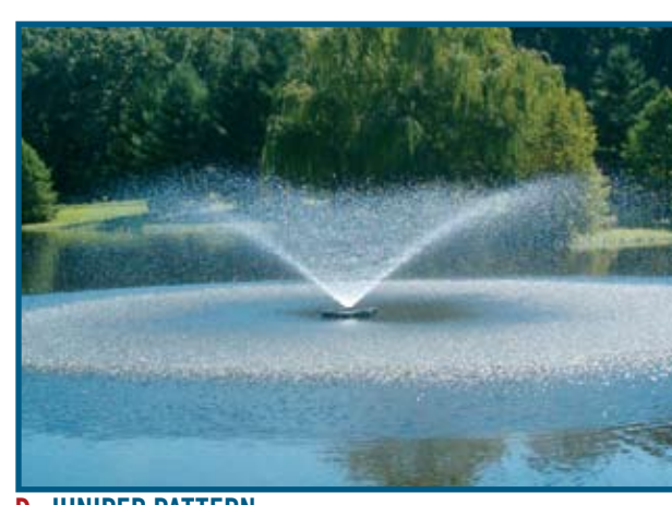
D JUNIPER PATTERN